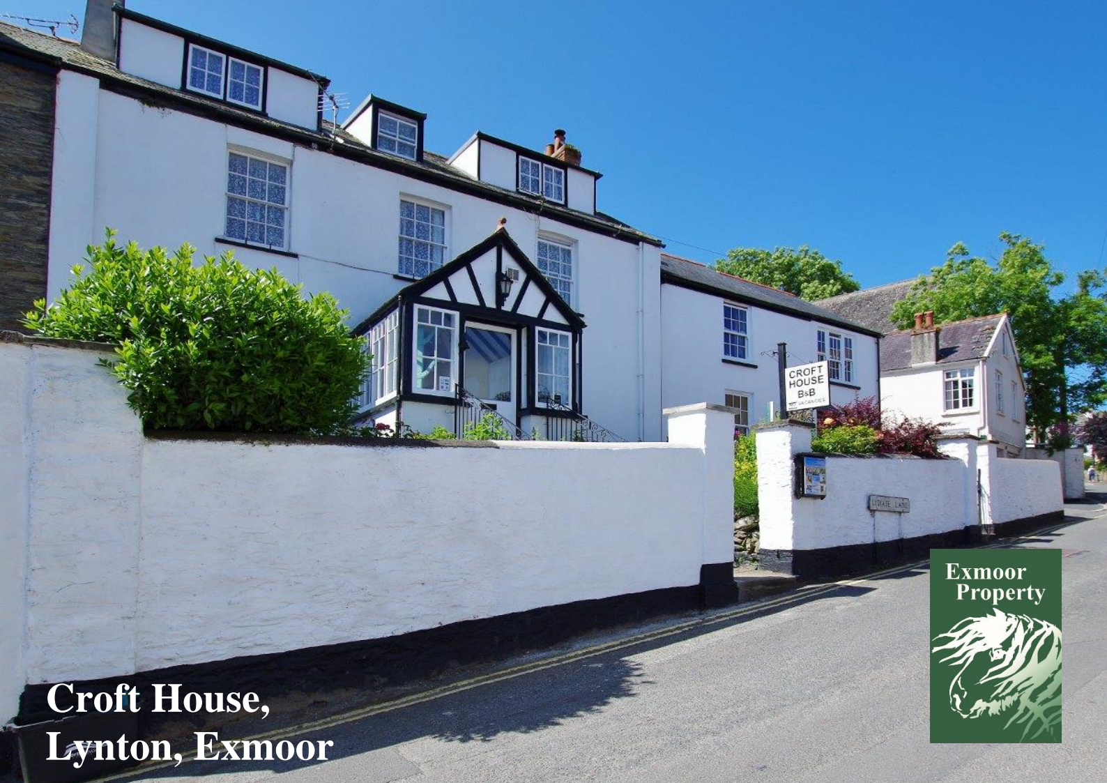
Croft House, Lynton, Exmoor